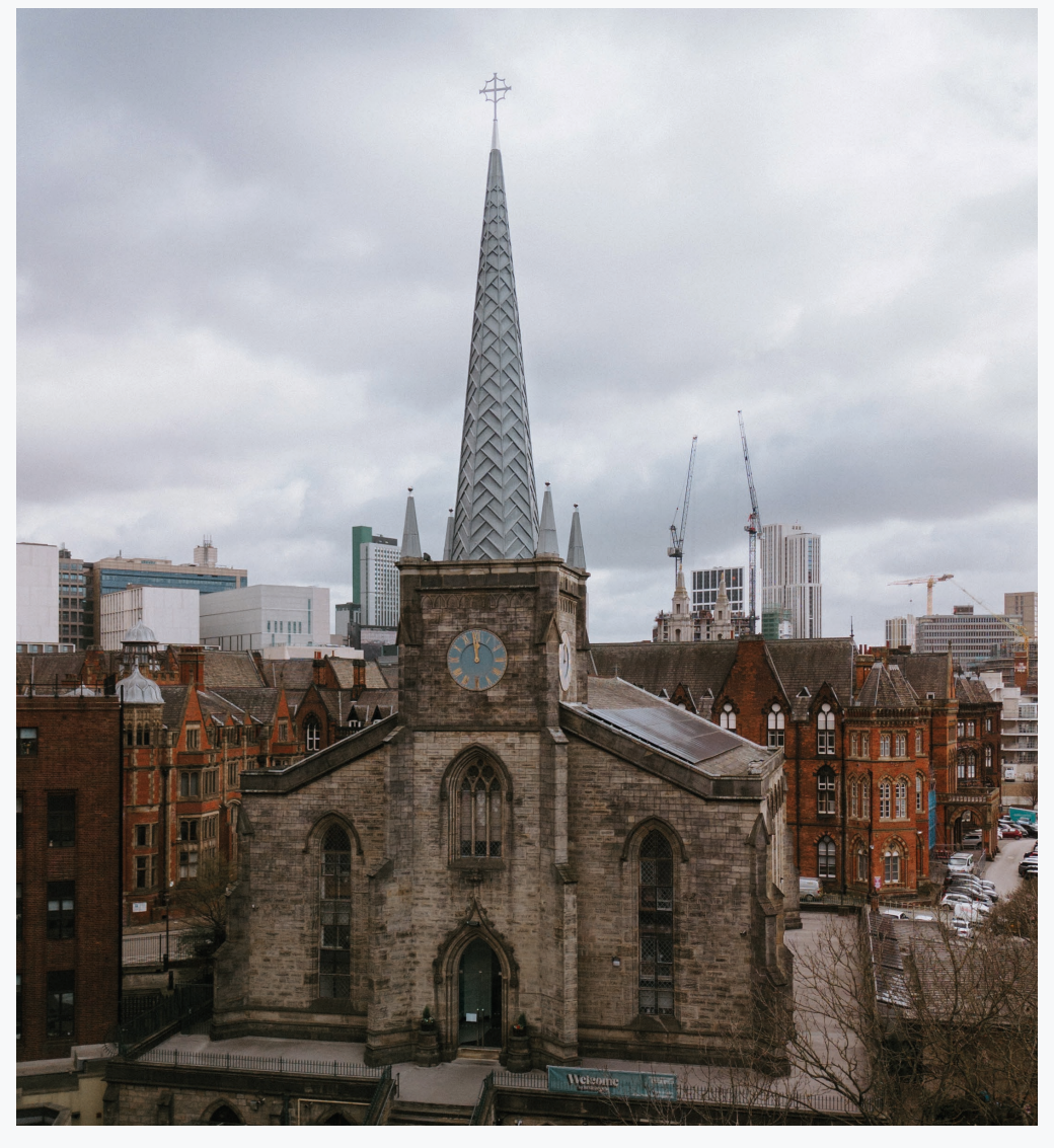
Preach Jesus, Make disciples, Serve the city & Send out leaders